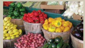
2012 HOT TREND: Locally Sourced Foods