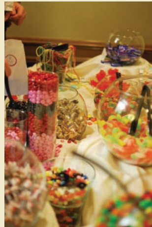
Banquet Trend: Candyland package

Plus our libation offerings... with an updated Wine List and Beverage selections. And don't forget the audio & visual portion of any event - it completes the interactive portion to any event!